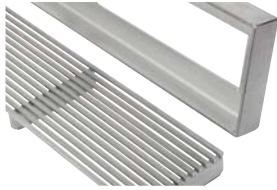
Grate and Frame